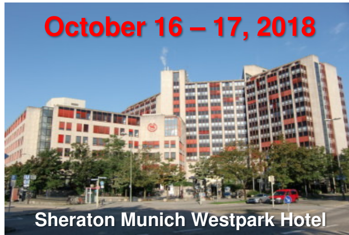
Sheraton Munich Westpark Hotel

Garmischer Straße 2 80339 Munich, Germany +49 89 51960